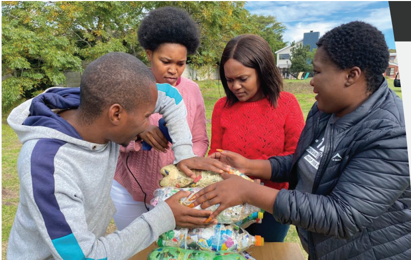
Aba bantu batsha bazinikele ekwenzeni umahluko kwaye bayinkuthazo kwingingqi yabo.

Le nkqubo yoqeqesho, exhaswa ngemali yiCookhouse Wind Farm kwaye ephunyezwa yiSomeone's Perfect Success, yayijolise kwiSikolo samaBanga aPhezulu iSipho Camagu esiseAdelaide; kwisiKolo samaBanga aPhezulu iLonwabo esiseBedford; iziKolo zamaBanga aPhezulu iCookhouse neJohnson Nqonqoza eziseSomerset East.